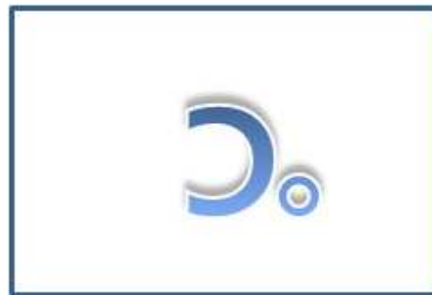
Fig.9-4 Horizontal and Vertical Flipped Image