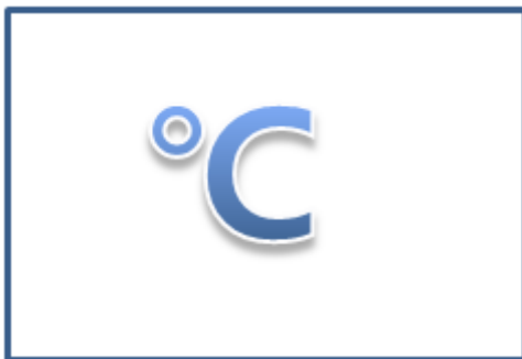
Fig.9-1 Standard Image