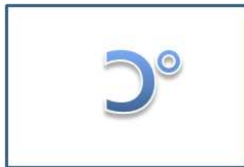
Fig.9-2 Horizontal Flipped Image