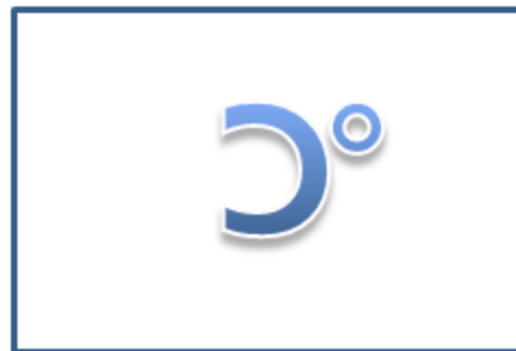
Fig.9-2 Horizontal Flipped Image