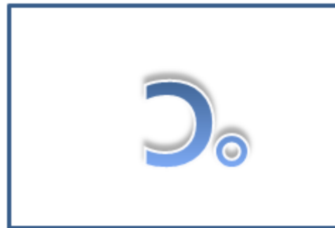
Fig.9-4 Horizontal and Vertical Flipped Image